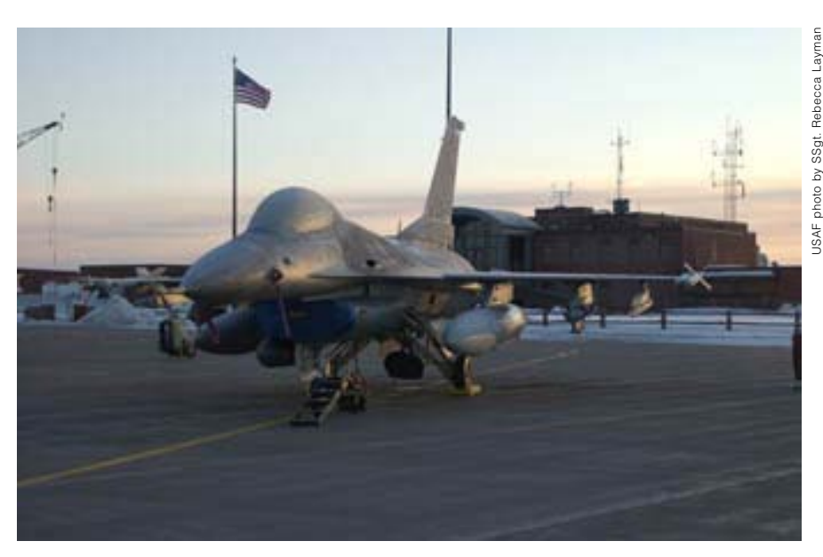
Fighter forces of the Air National Guard have played key roles in Operation Noble Eagle as well as operations in Southwest Asia. Shown here is an F-16 of the 148th Fighter Wing, Minnesota ANG.

^{\star} \text{Includes ANG} personnel assigned to Majcoms, FOAs, and DRUs.